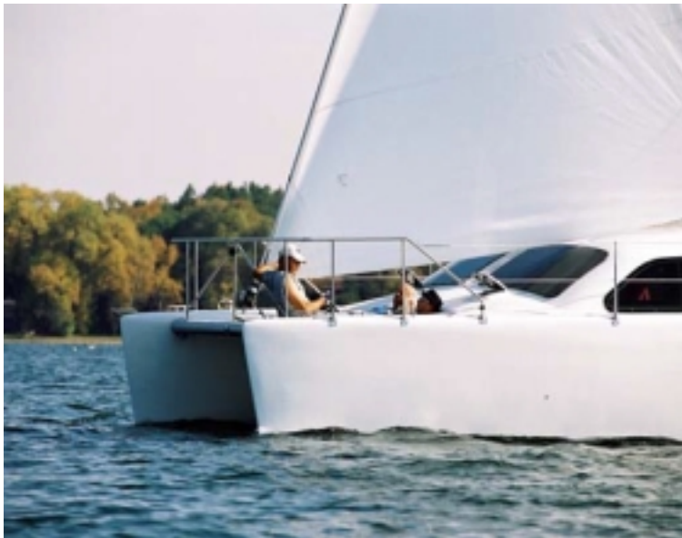
Enjoy a leisurely sail forward on the trampoline or aft on the seating built into the cockpit arch.

The design of the TomCat 9.7 takes full advantage of the best characteristics of a cruising catamaran - performance, comfort and go-anywhere shallow draft.