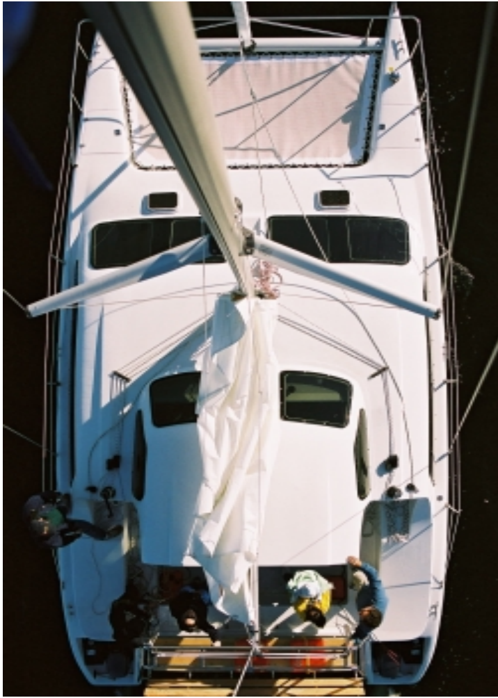
A view from the masthead shows the clean aerodynamic shapes of hulls, coachroof and rig. Note the side walkways and the arrangement of lines being led to the cockpit. The mainsheet traveller track is on top of the arch to keep the cockpit clear and uncluttered. Twin engines aft in the hulls are widely spaced and in front of the rudders for complete manoeuvrability under power.